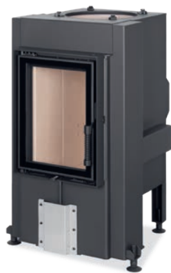
DYNAMIC 3G 38.50.01