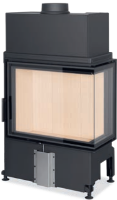
IMPRESSION R/L 2G S 71.60.34.21