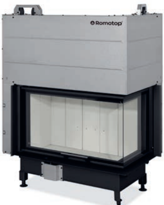
HEAT R/L 3G L 81.51.40.24