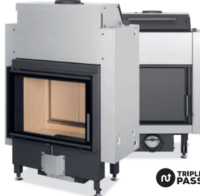
DYNAMIC WB 2G 66.50.01P