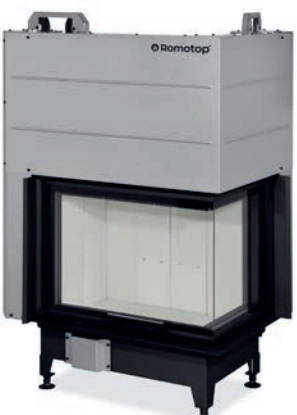
HEAT R/L 3G L 65.51.40.24