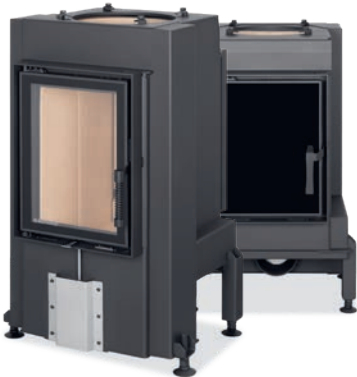
DYNAMIC B3G 38.50.01