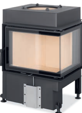
DYNAMIC R/L 3G S 55.44.42.21