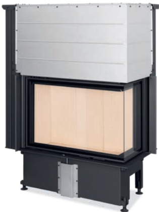
IMPRESSION R/L 2G L 83.60.34.21