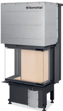
IMPRESSION C 2G L 67.61.34.21

Three-sided lifting door – split glazing