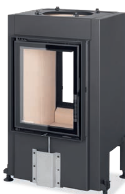
DYNAMIC T 3G 44.55.01

Tunnel – side opening, double straight glazing