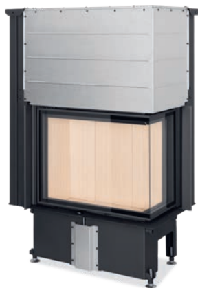
IMPRESSION R/L 2G L 71.60.34.21