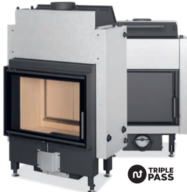
DYNAMIC WB 2G 66.50.01