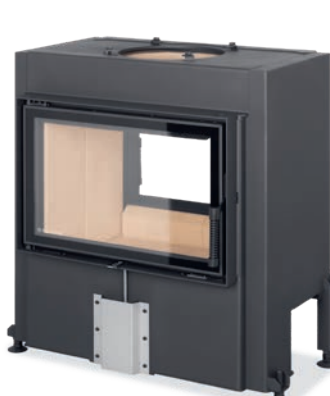
DYNAMIC T 3G 66.44.01