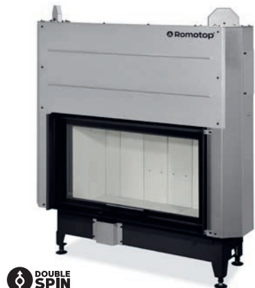
HEAT 3G L 88.50.04