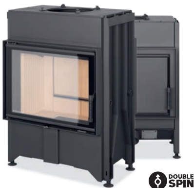
DYNAMIC B2G 66.50.01N