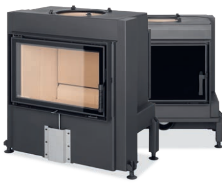
DYNAMIC B3G 66.44.01