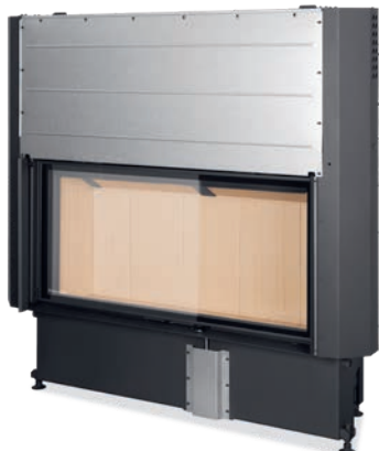
IMPRESSION 2G L 118.60.01