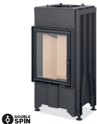
DYNAMIC 2G 44.55.01N

Side opening – double or triple straight glazing