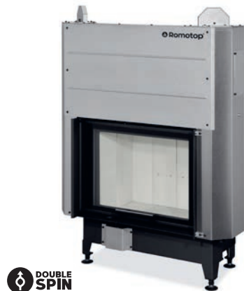
HEAT 3G L 66.50.04