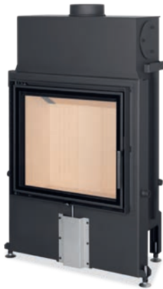
IMPRESSION 2G 67.60.01