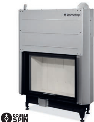
HEAT 3G L 88.66.04