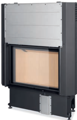
IMPRESSION 2G L 80.60.01