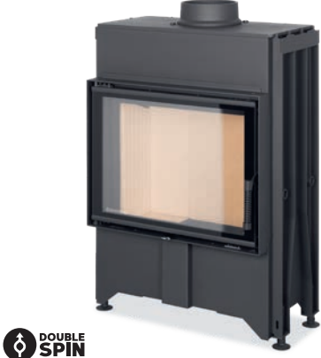
DYNAMIC 2G 66.50.13N