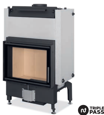
DYNAMIC W 2G 66.50.01

Side opening – double or triple straight glazing