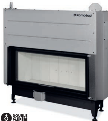
HEAT 3G L 110.50.04