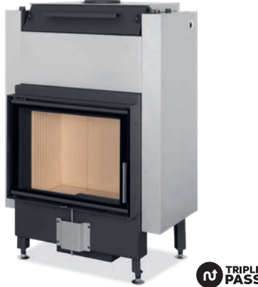
DYNAMIC W 2G 66.50.01P