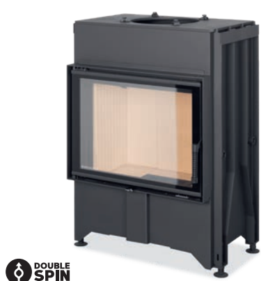
DYNAMIC 2G 66.50.01N