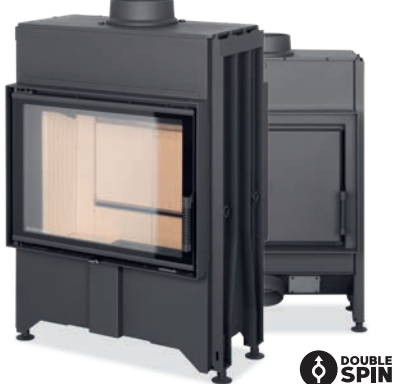
DYNAMIC B2G 66.50.13N