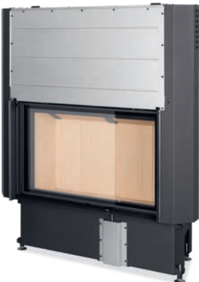
IMPRESSION 2G L 93.60.01