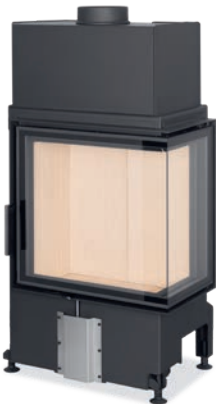
IMPRESSION R/L 2G S 58.60.34.21