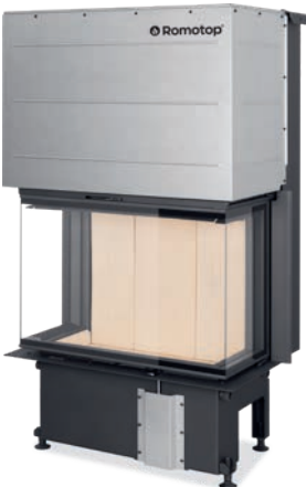
IMPRESSION C 2G L 80.61.34.21