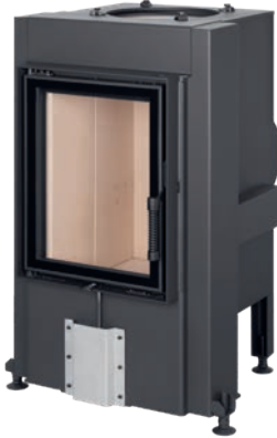
DYNAMIC 3G 44.55.01