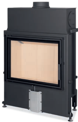
IMPRESSION 2G 80.60.01