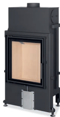
IMPRESSION 2G 55.60.01