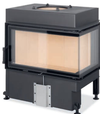
DYNAMIC R/L 3G S 72.44.42.21