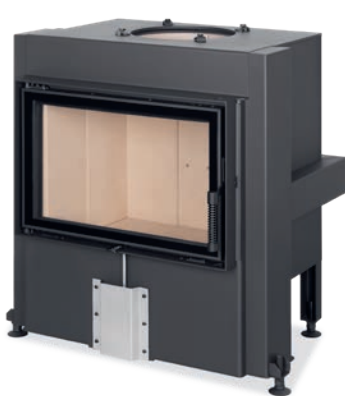
DYNAMIC 3G 66.44.01